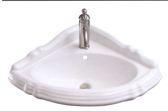
Faucet not included